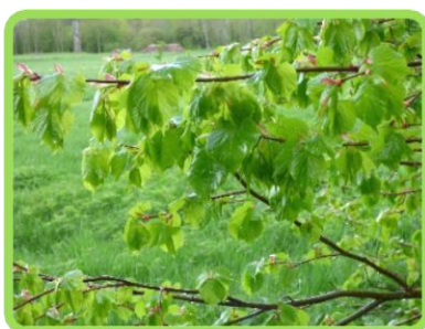
Sally Gray: April shower

Some images will be featured on our website, social media platforms, notice boards around the visitor centre and in our monthly newsletter. Please see our website for the full terms and conditions before submitting your work: www.houghtonhallpark.org/photography . See below some entries sent in for April's theme: Spring within Houghton Hall Park, thank you all for your creative entries!