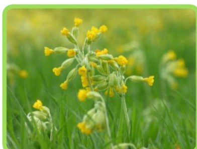
Sally Gray: Cowslips