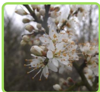
Ivor Mitchelmore: Blackthorn