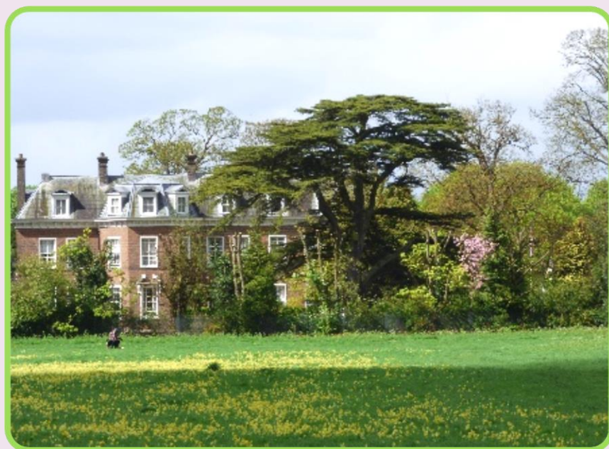
Sunshine and shade by Sally Gray

The Houghton Hall Park Renaissance and Renewal Project is being managed by Central Bedfordshire Council in partnership with Houghton Regis Town Council and is supported by the National Lottery through the Heritage Lottery Fund and the Big Lottery Fund.