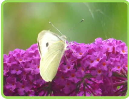
Butterfly on Buddleia

When I drove along the road the other day I got a total shock - I looked up and all the dead, lifeless trees were all green and full of leaves, with lots of blossom too. It was a sign that Spring is truly here. The sun was shining and it was a beautiful day, I saw a Red Kite flying overhead being chased by 2 angry crows, it made me smile.