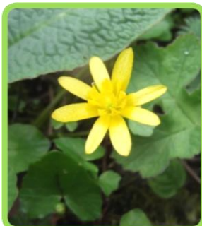
Ivor Mitchelmore: Lesser Celandine