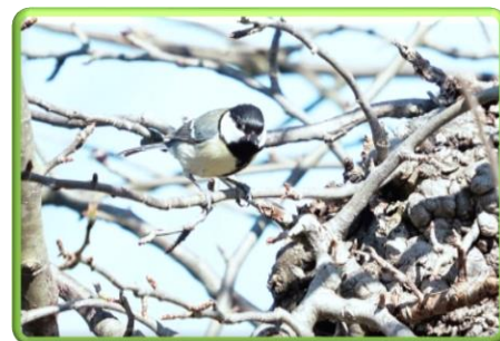
Checking the nest site

The last couple of weeks have been very busy for the birds that visit my garden. I've watched as finches, tits, blackbirds, robins and magpies have been gathering material for nest building. A pair of great tits started working on two nests, one they abandoned last year in the soffits of the house and another in a hollow of an apple tree close to the house. Even though the apple tree is a refuge for lots of birds who visit the nearby feeders and one of the routes the squirrels use to come into the garden, this was the site of their chosen nest. As a result, they spend a lot of time defending their space. I just hope they are successful in raising a brood. The squirrels will be their biggest threat, so I've moved one feeder further down the garden to tempt them away from the tree. I've also replaced the other feeders for squirrel proof ones.