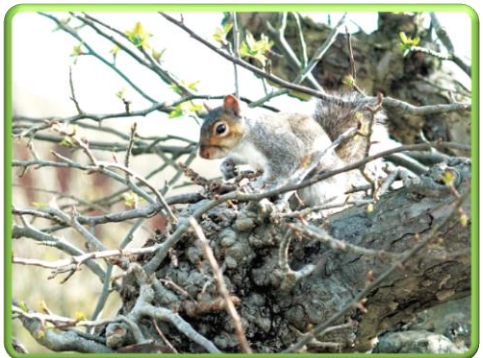
A squirrel by the nesting site

The last couple of weeks have been very busy for the birds that visit my garden. I've watched as finches, tits, blackbirds, robins and magpies have been gathering material for nest building. A pair of great tits started working on two nests, one they abandoned last year in the soffits of the house and another in a hollow of an apple tree close to the house. Even though the apple tree is a refuge for lots of birds who visit the nearby feeders and one of the routes the squirrels use to come into the garden, this was the site of their chosen nest. As a result, they spend a lot of time defending their space. I just hope they are successful in raising a brood. The squirrels will be their biggest threat, so I've moved one feeder further down the garden to tempt them away from the tree. I've also replaced the other feeders for squirrel proof ones.