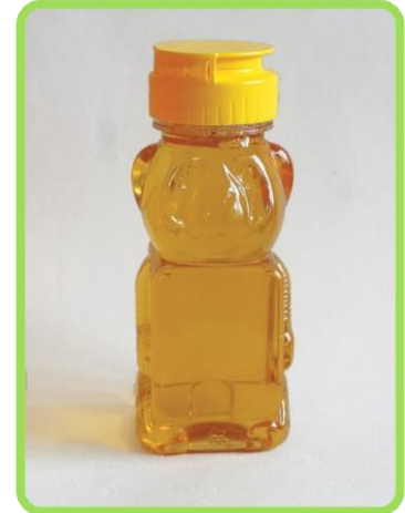
The final product – pure honey

The bees will need some honey left in the hive to see them through winter, but I may be able to get another couple of pounds before the end of the month.