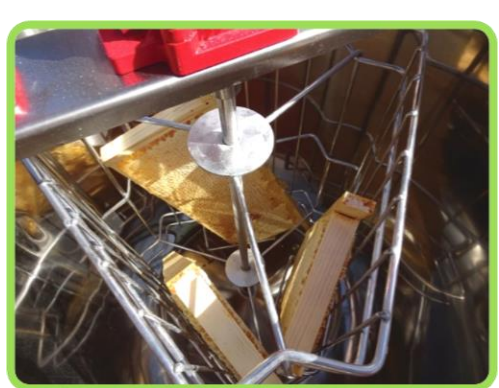
Three frames ready for extracting