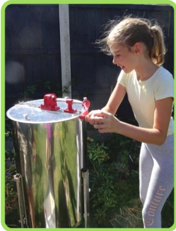
Spinning the honey out of the frames