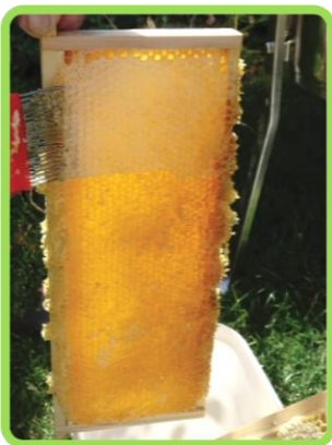
Removing the wax capping

I have taken two batches of three frames over a fortnight. The cells containing honey are on both sides of the frame, so I uncap one side at a time and spin the honey out, repeating the process for the other side. From the start through to bottling it is, as you can imagine, a very sticky process and the honey starts flowing as soon as you begin to remove the wax cap covering each cell, this is why I decided to do the extraction in the garden. Once both sides of the frames have been spun, they are removed and the extraction tank is left for a few hours to allow the honey to collect in the bottom of the tank. As honey is then drained from the tank into a small bucket, it is passed through a double sieve to remove any pieces of wax released during the spinning process. Before it can be bottled, the moisture content must be determined. If this is too high the honey will be prone to fermentation in the bottle. To do this a small sample of the filtered honey is placed in a refractometer, the ideal moisture content being between 17%-20%.