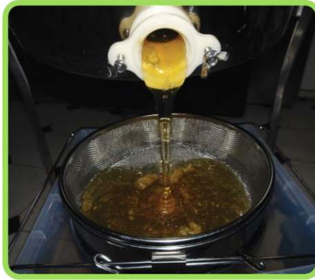
The honey is passed through a double filter