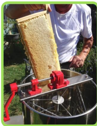
The frame is placed into the honey extractor