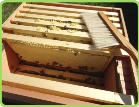
Frames in the hive full of honey

Having visited other hives early in the season, I wasn't very confident that my bees were going to produce much honey. The other hives I visited seemed to have many more active bees and were having second supers added to the hives. Supers are the sections above the brood chamber and queen excluder that contain the frames you hope the bees will store lots of honey. Excluding the queen from these frames, stops any of the cells being used for egg laying. It's not unusual to have half a dozen supers on a hive which would contain around sixty frames. As it turned out I needn't have worried. Although slow to get going, I'm pleased with what I have collected so far, around 7lbs from just the six frames I have taken.