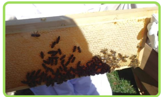
The bees will be gently brushed off the frame before taking the honey

I have taken two batches of three frames over a fortnight. The cells containing honey are on both sides of the frame, so I uncap one side at a time and spin the honey out, repeating the process for the other side. From the start through to bottling it is, as you can imagine, a very sticky process and the honey starts flowing as soon as you begin to remove the wax cap covering each cell, this is why I decided to do the extraction in the garden. Once both sides of the frames have been spun, they are removed and the extraction tank is left for a few hours to allow the honey to collect in the bottom of the tank. As honey is then drained from the tank into a small bucket, it is passed through a double sieve to remove any pieces of wax released during the spinning process. Before it can be bottled, the moisture content must be determined. If this is too high the honey will be prone to fermentation in the bottle. To do this a small sample of the filtered honey is placed in a refractometer, the ideal moisture content being between 17%-20%.