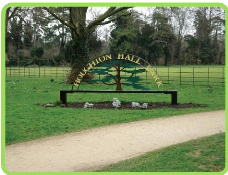
The Park sign bed ready to be planted up.

We cannot forget the amount of work done in the formal garden either. As a heritage garden the layout and planting cannot be changed, but when Jenny arrived it needed a substantial amount of TLC. Again, starting with those early volunteers, a lot of invasive weeds have been either eradicated or greatly reduced, all done without the use of chemicals. Although the layout can't be altered, additions have been made. The Houghton Hall sign near the cedar tree has been installed at the entrance to the park from the gardens and new borders created with thousands of bulbs planted. Daffodils are currently appearing around the cedar tree and along the hedge at the side of the cedar lawn. In a month or so tulips and alliums will pop up along the hedge opposite the kitchen garden. The raised bed at the end of this area is also a Jenny addition. There have also been numerous improvements Jenny has instigated to behind the scene areas. Sowing seeds, potting up and preparing produce for sale along with other activities, can now be done more productively and in a bit more comfort than in those early days.