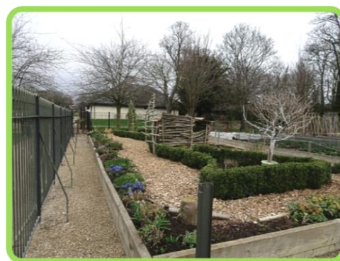
Bed 7 ready for this year's Easter display.