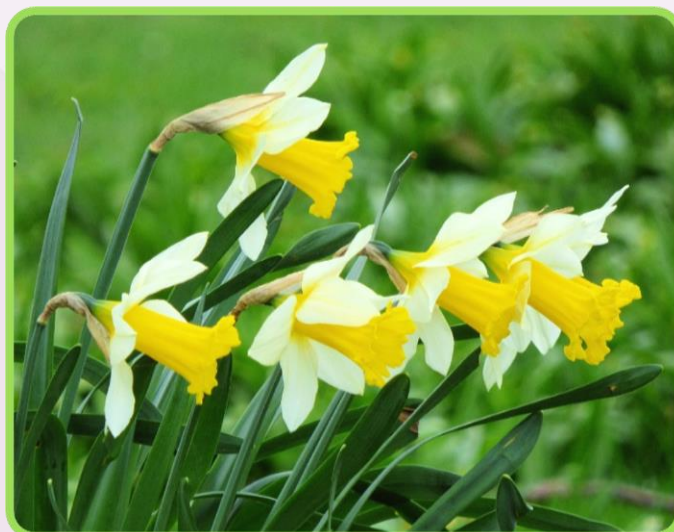
By Rita Egan

As we enter March spring is definitely in the air, we are now waking up to light rather than darkness, green shoots are starting to appear on the trees and spring flowers are starting to bloom, the overall feeling is one of change and hope, seeing recent events in Ukraine you can really appreciate what we have on our doorstep and know never to take it for granted. Life continues in the park with lots of preparations for the year ahead, our activity and events programme is underway and this month we have our Mother's Day floral workshops, these are all sold out but if you would like expert tuition on how to create a floral masterpiece, using fresh foliage and flowers, we are running a number of Easter workshops which include evenings (and a hot cross bun!), more information can be found in our 'What's On' pages, along with everything you need to know about our new event in May, 'Bark Run'.