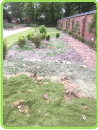
This area has changed considerably.

The park area covers around forty-two acres and at the time of her arrival, had no water available for wildlife, Jenny was keen to remedy this and pushed for permission to have a wildlife pond within the kitchen garden. Once given the go ahead, a pond was constructed and filled solely with collected rainwater. A deck which overhangs the water to allow pond dipping was built and installed. Jenny tracked down second-hand railings and gates which are being put in at the moment. As an ongoing project a children's area will be built next to the pond area. Facilities will allow children to examine items from pond dipping and express their creative side with craft events. Work has also started on the construction of a produce hut by the gates to the yard. This will provide a permanent place where produce, grown in the garden, can be sold.