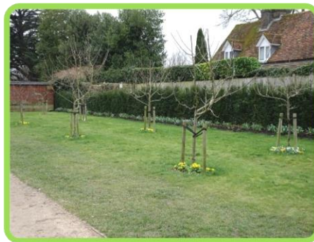
Bulbs appearing in the border opposite the kitchen garden