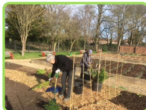
A couple of the early volunteers planting in newly prepared beds.