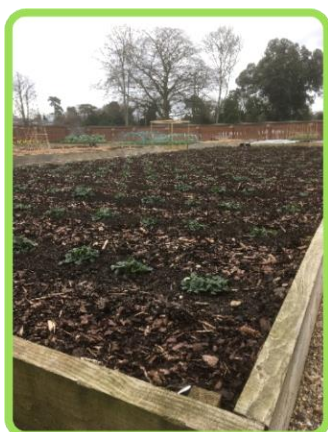
An early view across the kitchen garden after a lot of hard preparation work.