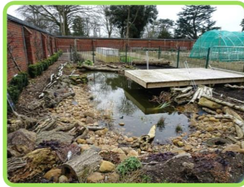
The pond proving much needed water for wildlife.

We cannot forget the amount of work done in the formal garden either. As a heritage garden the layout and planting cannot be changed, but when Jenny arrived it needed a substantial amount of TLC. Again, starting with those early volunteers, a lot of invasive weeds have been either eradicated or greatly reduced, all done without the use of chemicals. Although the layout can't be altered, additions have been made. The Houghton Hall sign near the cedar tree has been installed at the entrance to the park from the gardens and new borders created with thousands of bulbs planted. Daffodils are currently appearing around the cedar tree and along the hedge at the side of the cedar lawn. In a month or so tulips and alliums will pop up along the hedge opposite the kitchen garden. The raised bed at the end of this area is also a Jenny addition. There have also been numerous improvements Jenny has instigated to behind the scene areas. Sowing seeds, potting up and preparing produce for sale along with other activities, can now be done more productively and in a bit more comfort than in those early days.