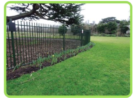
Daffodils around the cedar tree.