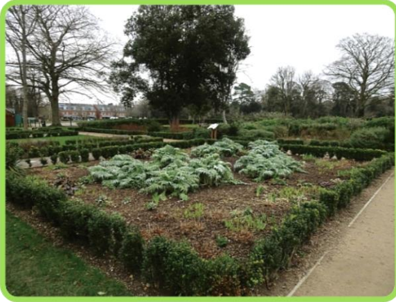
A recent view of the formal garden

Jenny brought with her the philosophy of permaculture, where soil structure and its improvement are maintained as a natural process. To this end we follow a no dig policy, instead each year beds are heavily mulched, which helps to suppress weeds and feed the soil. This also maintains the natural ecosystem of the soil. To avoid walking on and compressing the soil, bark pathways are put between the growing areas and are replenished annually. This improves drainage and as it slowly decomposes adds nutrients to the soil.