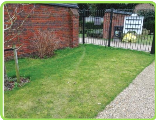
Fox track in the grass

Fox fact:- Unlike dogs, foxes don't have facial muscles that enable them to bare their teeth.