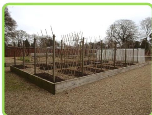
Bed 3 being prepared for this season's crop.