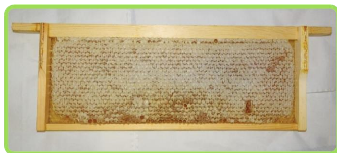
A full frame of capped honey comb straight from the hive.