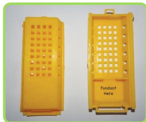
The righthand image shows the inside of a queen cage.

Volunteer at Houghton Hall Park and Gardens.