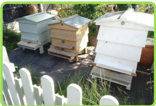
I now have three hives at the bottom of my garden.

It's certainly been a busy time with my bees. Last month I mentioned that they had swarmed and I put them into a new hive. I left the new hive and the one they swarmed from, to settle for a week