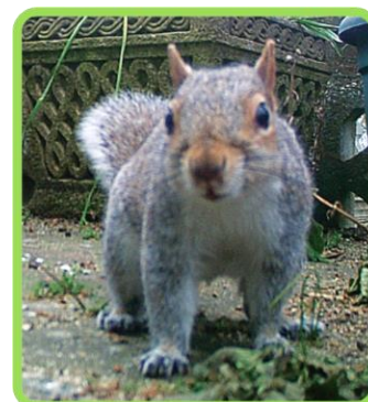
This female squirrel is a regular visitor and becoming quite tame.