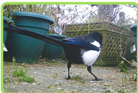
A Magpie looking for the mealworms I put out daily.

Quite a record considering we've lost around ten million pairs since the 1960's. Blue tits came in second their numbers remaining steady. Starling numbers are still in decline but managed to take third spot. Long tailed tits have made a remarkable recovery moving up from fifteenth to tenth place in a year.