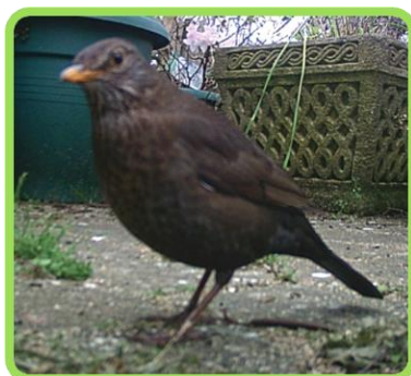
The female blackbird arrives as soon as her mate leaves.