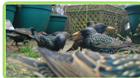
Starling numbers visiting my garden are increasing.