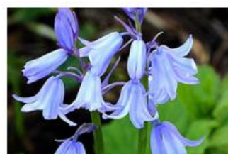
Rita Egan 1