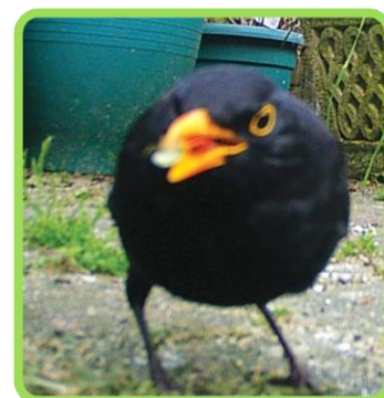
The female blackbird arrives as soon as her mate leaves.

My bees too have been extremely busy, making the most of warm days. In a week they filled most of the frames in the brood chamber. This is the section where the queen lays her eggs. I have added another two sections in the last three weeks. These are known as supers, each containing eleven frames and is where bees will store honey. However, it's not all been plain sailing. I had my first swarm with some of the bees taking up temporary residence in a neighbour's tree. I was lucky they were in lower branches and could reach them with a step ladder. Despite them congregating in two large clumps, I managed to knock most of them