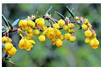
Rita Egan 4