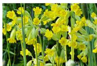
Rita Egan 3