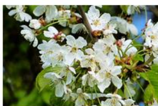
Rita Egan 2