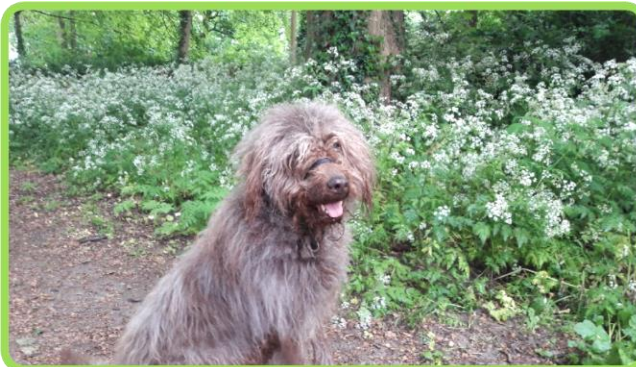
Spoony the Labradoodle by Gabby Stares