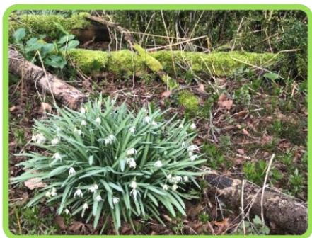
Michele Foulger: Emerging Spring