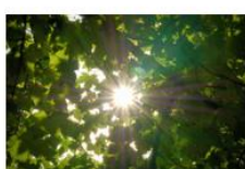
Sunlight By Helen Pocock