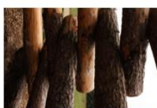
Light 4 By Emma Clements