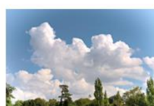
Sunlit Clouds By Helen Pocock