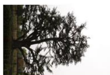
Light 2 By Emma Clements