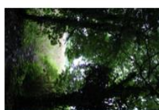
Light 5 By Emma Clements