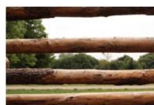
Light 3 By Emma Clements