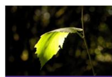
Light On A Leaf By Helen Pocock