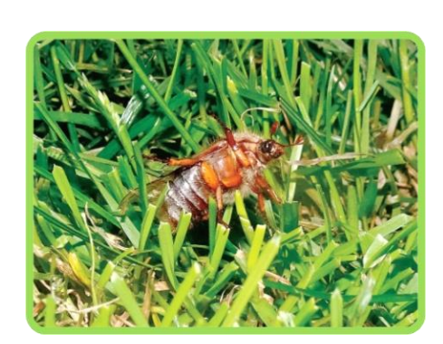
A Drone Fly struggles to safety in the grass