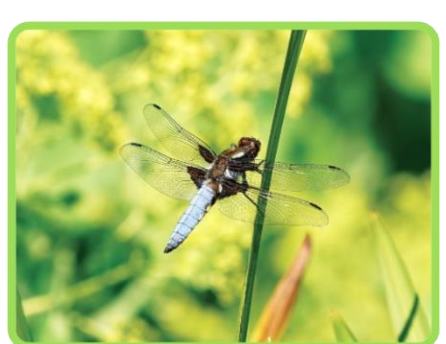
A Wide-Bodied Chaser