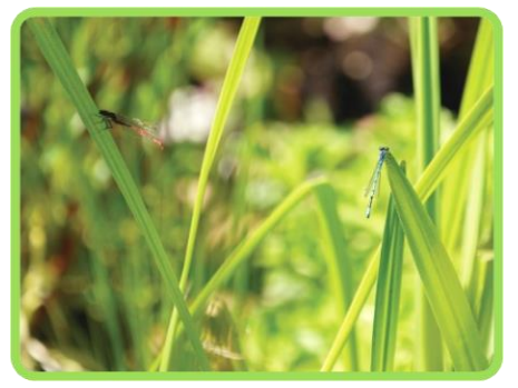
Large Red and Azure Damselflies