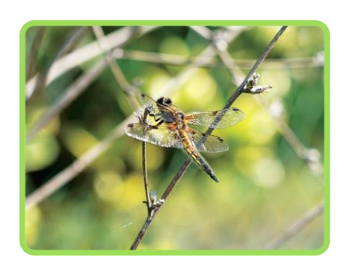
A Four Spotted Chaser warms in the sunshine

been activity at the pond in the kitchen garden. Earlier in the month several blue tailed damsel flies could be seen flitting across the water in search of a resting place. These were followed by the arrival of Broad bodied chasers and an Emperor dragonfly I spotted laying its eggs.