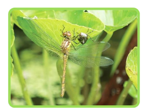
A Southern Darter removes last of its nymph casing