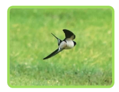
A Swallow twists its tail to make a