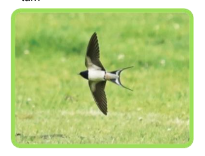
Showing the beautiful tail of a Swallow