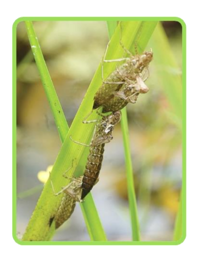
This reed proved popular as nymphs emerged

In my pond which I started building in May last year, nymphs have been climbing up the vegetation ready to emerge as damsel and dragon flies. Hopefully all these new hatchings will mate and lay eggs for the next generation. I managed to get a picture of a female Southern Darter removing the last of its nymph casing, as if it was a flying helmet. New sightings this year have been Broad Bodied Chasers and Four Spotted Damselflies. I also found a newly emerged Drone fly crawling in the grass near the pond. The larvae of these are known as rat tails maggots. They get this nickname as they have maggot like, sausage shaped bodies and a tail from which they can extend a long breathing tube. Although not fully planted there has also