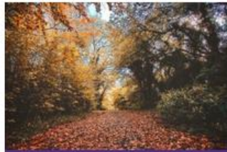
Photography Passion JT 2