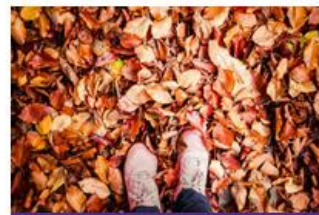
Photography Passion JT 5