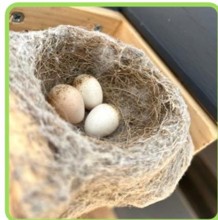
This is an Australian Willy Wagtail nest held together with cobwebs

Before I finish, I thought you might like to see a picture my brother sent me from Western Australia. It's spring time there, so the birds there are nesting now. The picture is of a Willy Wagtail nest with three eggs taken in his garden. Built of grass the nest is held together with cobwebs carefully applied by the birds and is a speciality of Willy Wagtails.