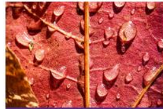
Photography Passion JT 1