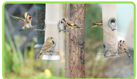
Getting busy at the feeders