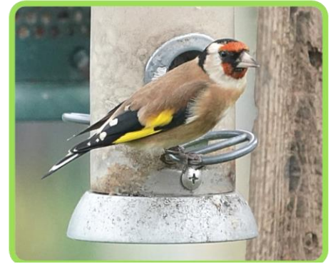
Showing the varied colours of the goldfinch

If you want to encourage these beautiful birds into your garden, I have found that sunflower hearts are best, I have tried niger seed, but they ignored it completely. They also seem to like a bit of nearby cover and frequent the feeders near an apple tree in my garden. Because their diet is