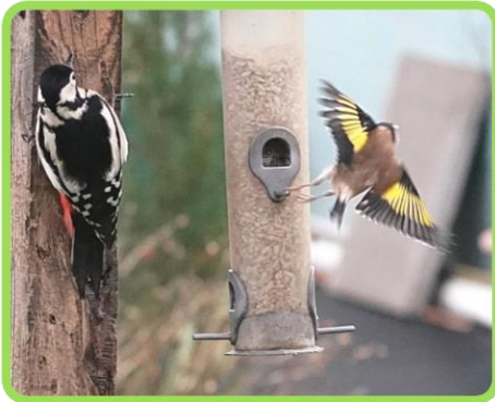
A woodpecker taken by surprise as a goldfinch spreads its wings