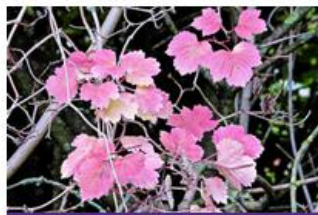
Rita Egan 4