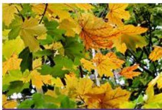
Rita Egan 5