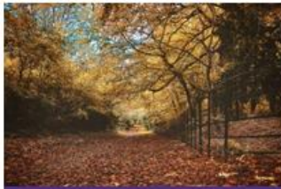
Photography Passion JT 3