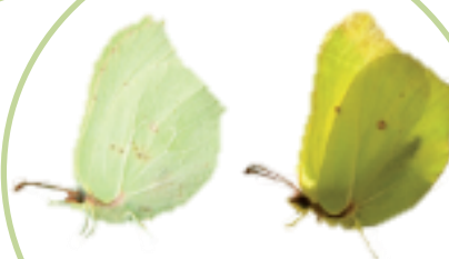
Brimstone Rests with wings closed