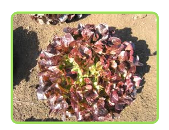
Oak leaf Navara

Keep your watering and feeding regime going this month for all your chillies, peppers and tomatoes. You may want to think about thinning some of your tomato leaves off to let the sun ripen the fruits. Keep your watering steady to reduce the skins splitting.