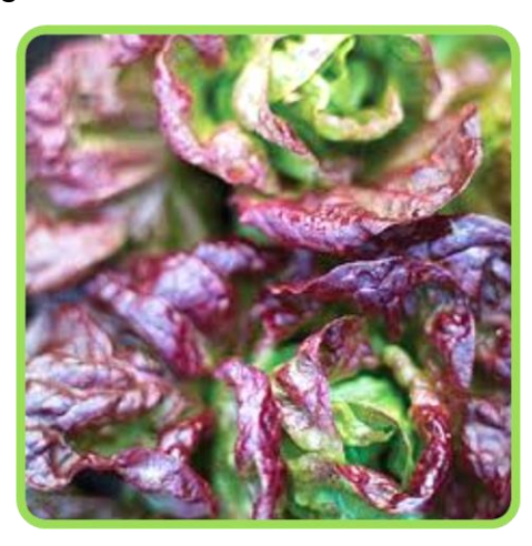
Marvel of 4 seasons